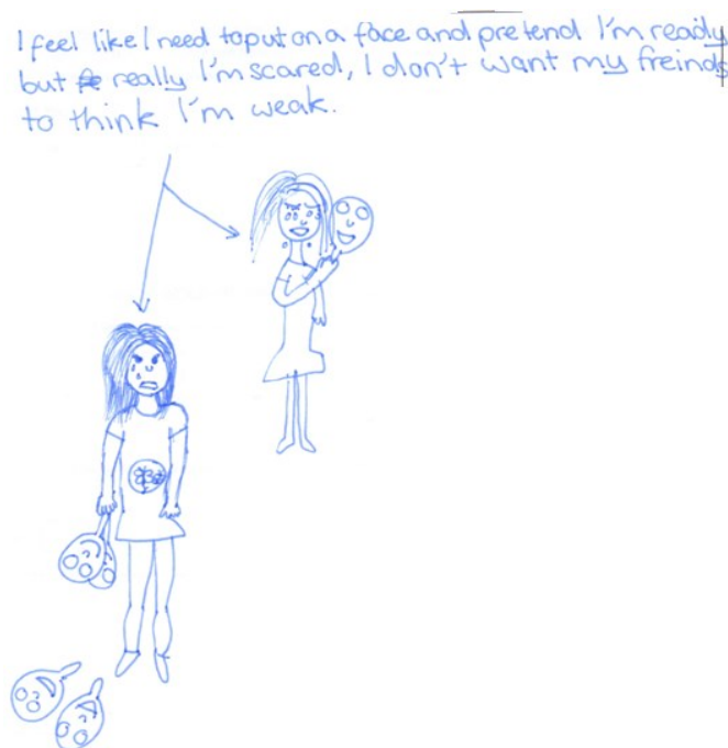
Fig. 2: A Pre-transition Student’s Drawing that Illustrates Anxiety

However, because of what was considered achievable within the academic requirements of the task a recurring theme within my Critical Study was recognising what would be extended or changed as part of a larger follow-up piece of future research. For example, it was not possible to include the participants in the data analysis stage of the research, which is something that I would have developed with fewer time constraints.