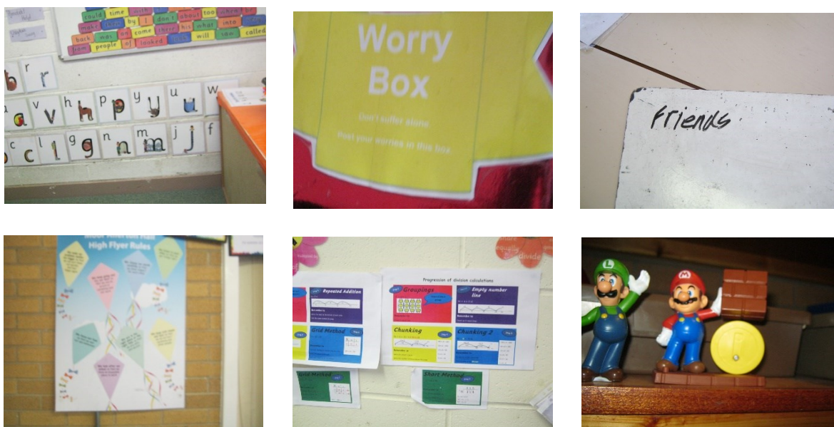
Fig. 3: Photographs taken by the pupils

The interviews enabled pupils to discuss issues that could not be photographed, though this was less successful with the younger pupils and those with additional emotional needs. One pair of younger pupils struggled with the formality of the interview and giggled throughout, unable to focus for very long. Questions were treated as if part of a quiz, with one pupil racing to provide the 'correct' answer, unable to reflect as the older pupils could, possibly due to a relative lack of emotional and verbal maturity. Another pupil became quickly distracted and withdrawn after I had addressed the fact that he had grabbed the earphones out of my hand, subsequently asking me to stop. For this child, who experienced difficulty in relating to others, the perceived intensity of the one-to-one interview was inappropriate and an alternative method should, in hindsight, have been considered, particularly given the potential power imbalance conveyed through my role as both teacher and researcher in the situation. One method which was noticeably less successful in terms of producing data was the "If I were a teacher..." / "If I could wave my magic wand..." proformas. Only one pupil responded to these (Figure 2), but this pupil only took three photographs for the study,